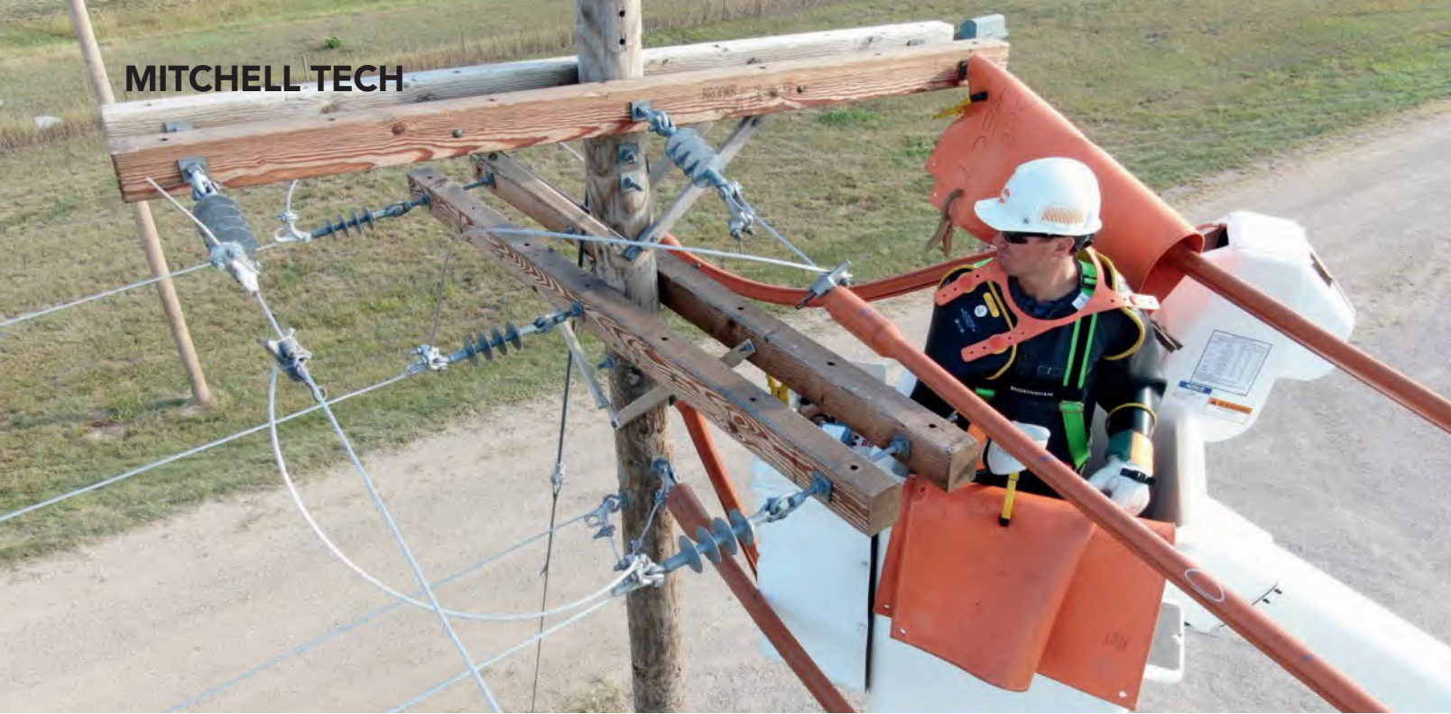
Mitchell Tech facilities were used for the annual electric cooperative rubber gloving school last summer.