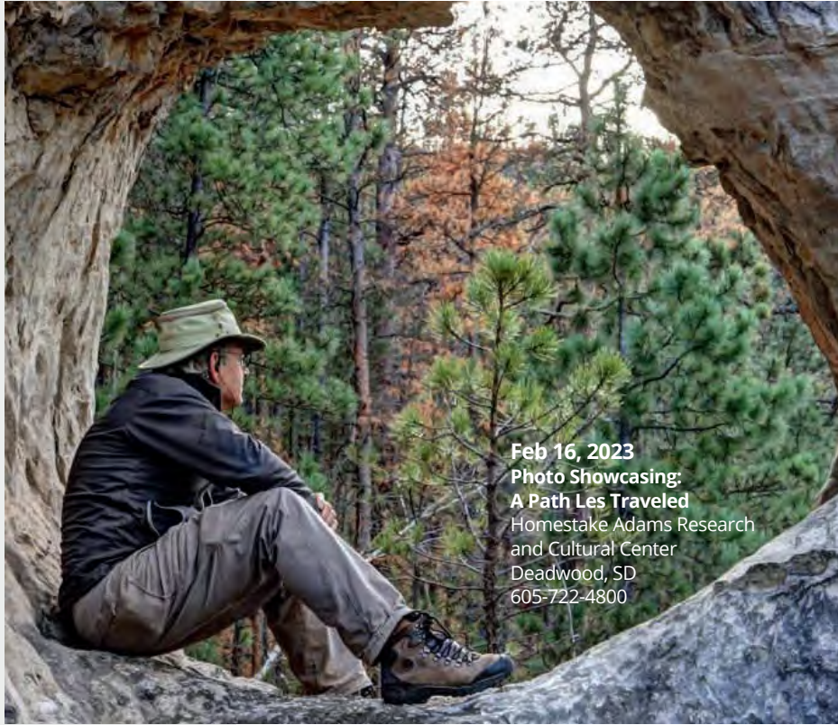
Feb 16, 2023 Photo Showcasing: A Path Les Traveled Homestake Adams Research and Cultural Center Deadwood, SD 605-722-4800

To have your event listed on this page, send complete information, including date, event, place and contact to your local electric cooperative. Include your name, address and daytime telephone number. Information must be submitted at least eight weeks prior to your event. Please call ahead to confirm date, time and location of event.