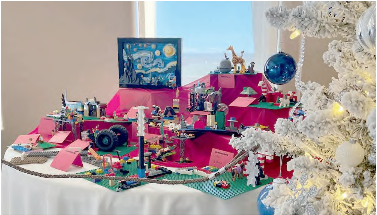
This display was created by the local Lego club and attracted a lot of interest during the Christmas season.