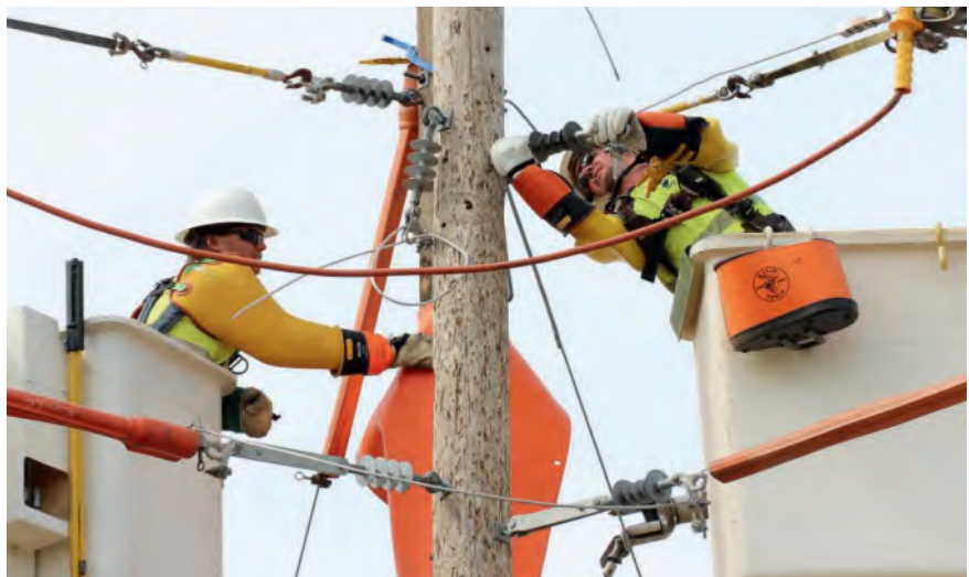
MTC is a prime training ground for future co-op linemen.

For more information about MTC, visit www.mitchelltech.edu .