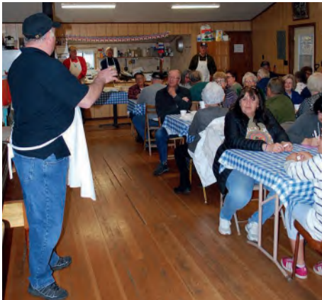
Rochford Area Meeting 2019