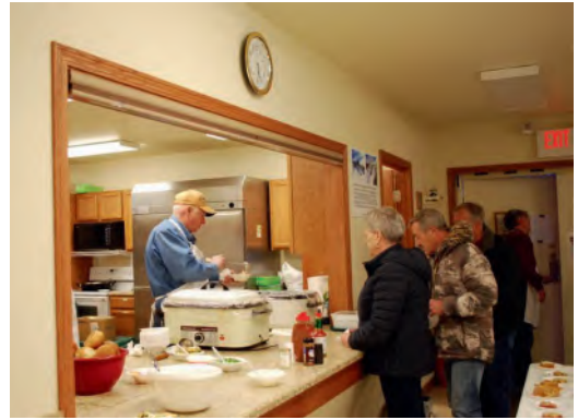
Johnson Siding Area Meeting 2019

We are looking forward to seeing and catching up with everyone!