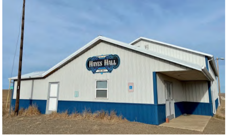
For a few nights every year, Hayes Hall gets packed to standing-room only. West Central Electric Cooperative provides the hall's electrical power and is an annual sponsor of the Hayes play.

And good news for those who are interested: Friends of the Arts is looking to expand that family.