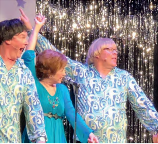
Friends of the Arts also does musicals! One of their most recent productions was Polyester the Musical , a disco-style musical comedy.