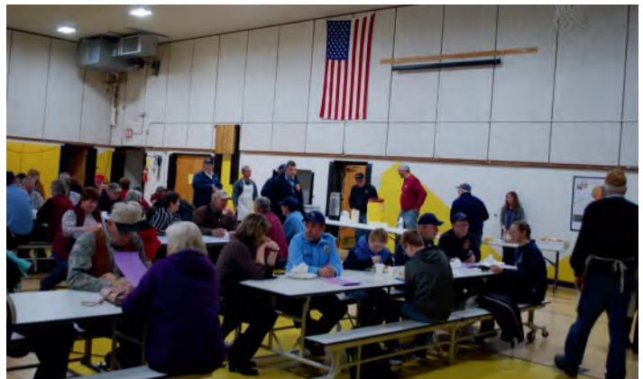
Hermosa Area Meeting 2019