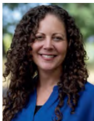
Miranda Boutelle Efficiency Services Group

Sheet metal and high-temperature heat-resistant caulk should be used to seal gaps between framing, chimneys and metal flues.