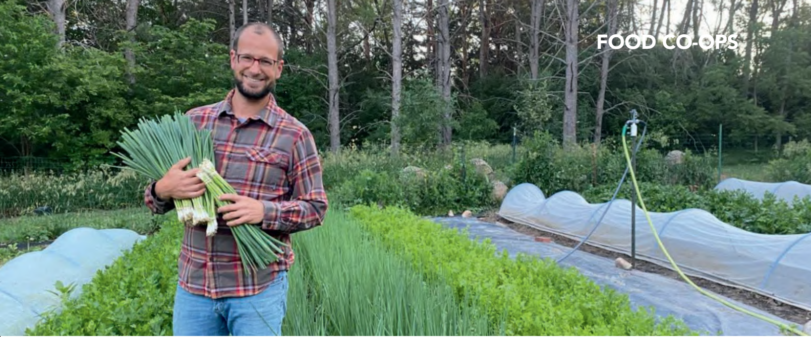
Caselli's Garden is among a growing list of fresh food suppliers for Dakota Community Market.

is designed to provide financing to help build the economic base of rural communities within East River Electric's regional service area. Hundreds of organizations, businesses, medical facilities, housing projects and many more have received financial support through the REED program over the past 20 years.