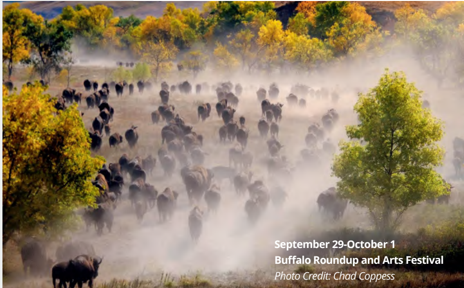
September 29-October 1 Buffalo Roundup and Arts Festival

To have your event listed on this page, send complete information, including date, event, place and contact to your local electric cooperative. Include your name, address and daytime telephone number. Information must be submitted at least eight weeks prior to your event. Please call ahead to confirm date, time and location of event.