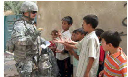
Toy cars are distributed by military personnel serving overseas.