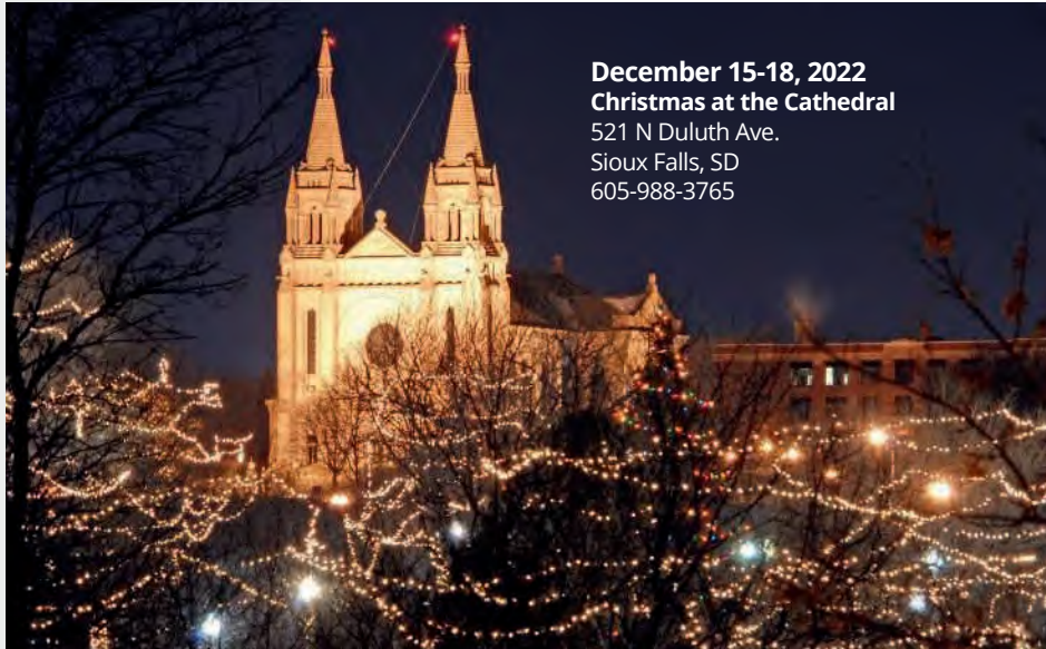
December 15-18, 2022 Christmas at the Cathedral 521 N Duluth Ave. Sioux Falls, SD 605-988-3765

Your Phone Number: _____ Your E-mail Address: _____