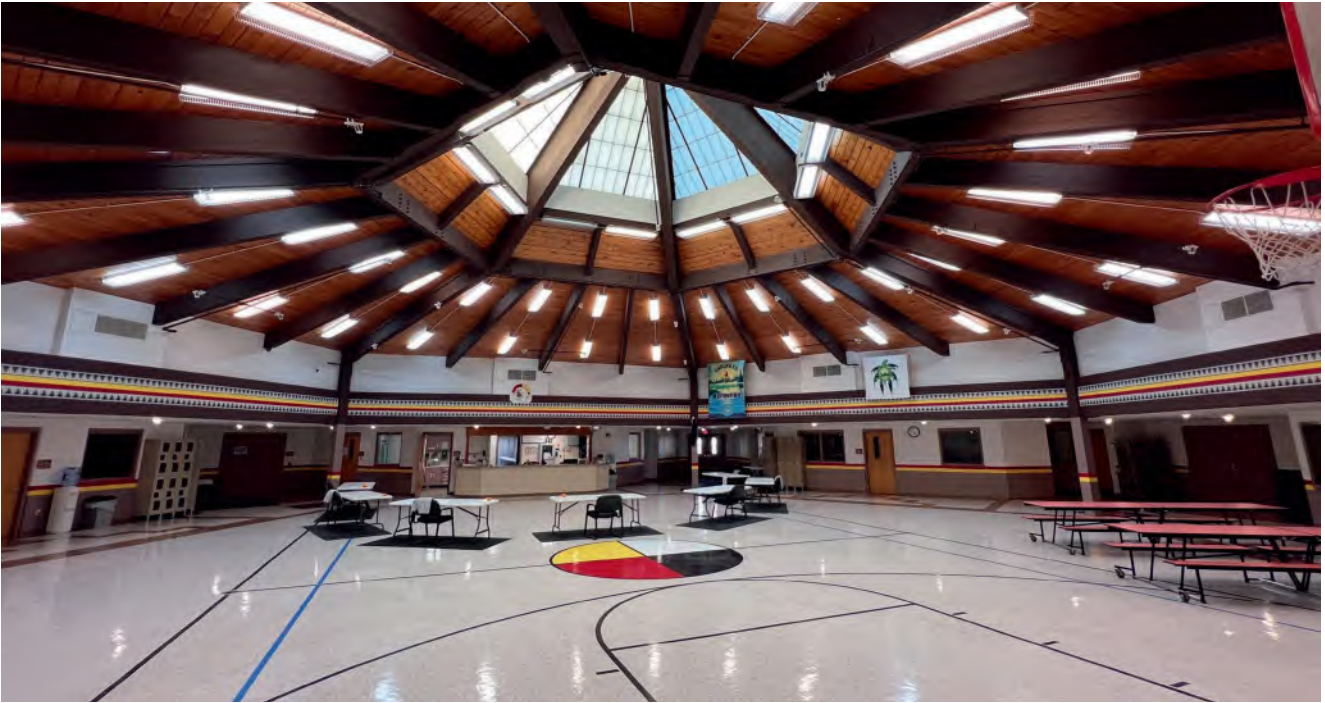
The youth treatment center is located in the former Chief Gall Inn hotel near Mobridge.

space, but they also listen to their concerns, answer questions and try to allay their fears that stem from living in a new environment with certain rules, guidelines and expectations.