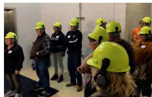
Photos of the 2022 Dry Fork Bus Tour attendees. Please contact the office if you're interested in going on the 2023 Bus Tour.