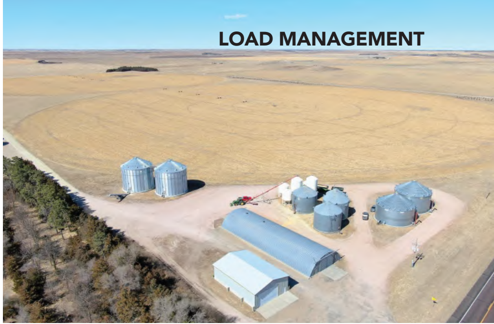
All of the roughly 200 irrigation pivots at Danielski Farms are under Cherry-Todd Electric’s load management program.

Another element that makes the program work for Danielski Farms is the installation of a remote irrigation control system. All of Danielski’s pivots