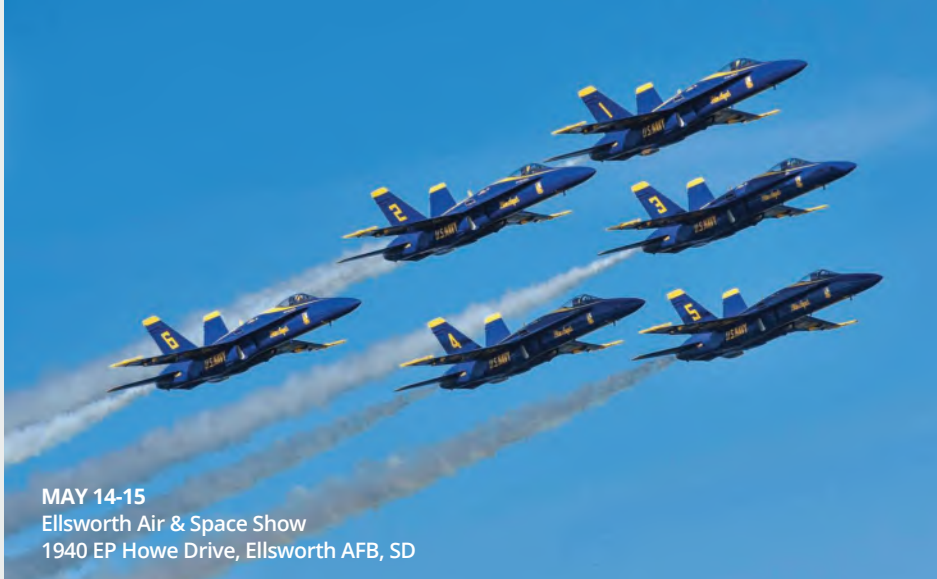
MAY 14-15 Ellsworth Air & Space Show 1940 EP Howe Drive, Ellsworth AFB, SD

To have your event listed on this page, send complete information, including date, event, place and contact to your local electric cooperative. Include your name, address and daytime telephone number. Information must be submitted at least eight weeks prior to your event. Please call ahead to confirm date, time and location of event.