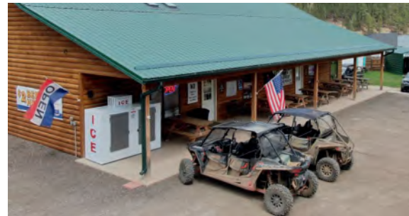
Many ATV trails across the state have access to fishing, scenic vistas and places to pull over for refreshments such as the Merchantile store in Nemo shown above.

as well as multi-day and seasonal passes. Camp sites are available at a rate of $20 per night with electricity and $10 without.