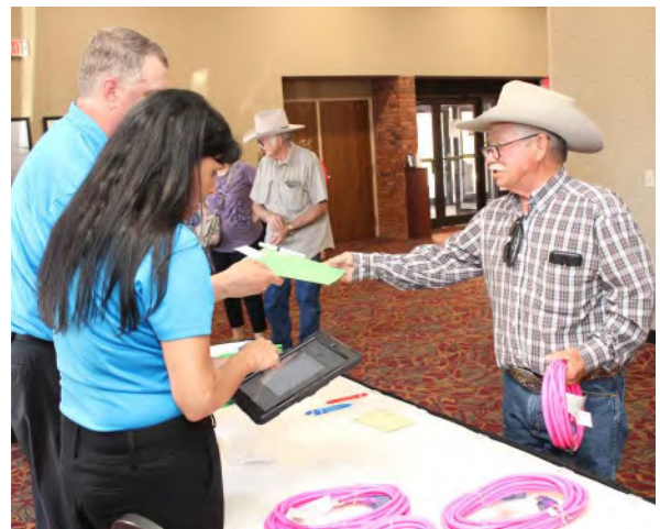
Members registered electronically this year thanks to advancements in technology.