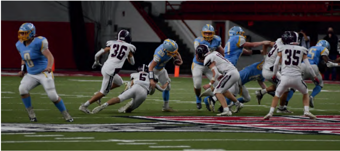
Officials at the SDHSAA say they plan to resume a normal slate of events this fall.

as the pandemic ran its course,” he said. “We listened to those in the health profession for their recommendations based on what they were experiencing and balanced that with recommendations and observations that were coming from other quarters. The governor’s office trusted us and gave us the space we needed to make the best decisions.”