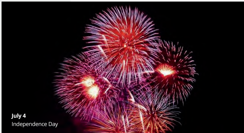
July 4 Independence Day

To have your event listed on this page, send complete information, including date, event, place and contact to your local electric cooperative. Include your name, address and daytime telephone number. Information must be submitted at least eight weeks prior to your event. Please call ahead to confirm date, time and location of event.