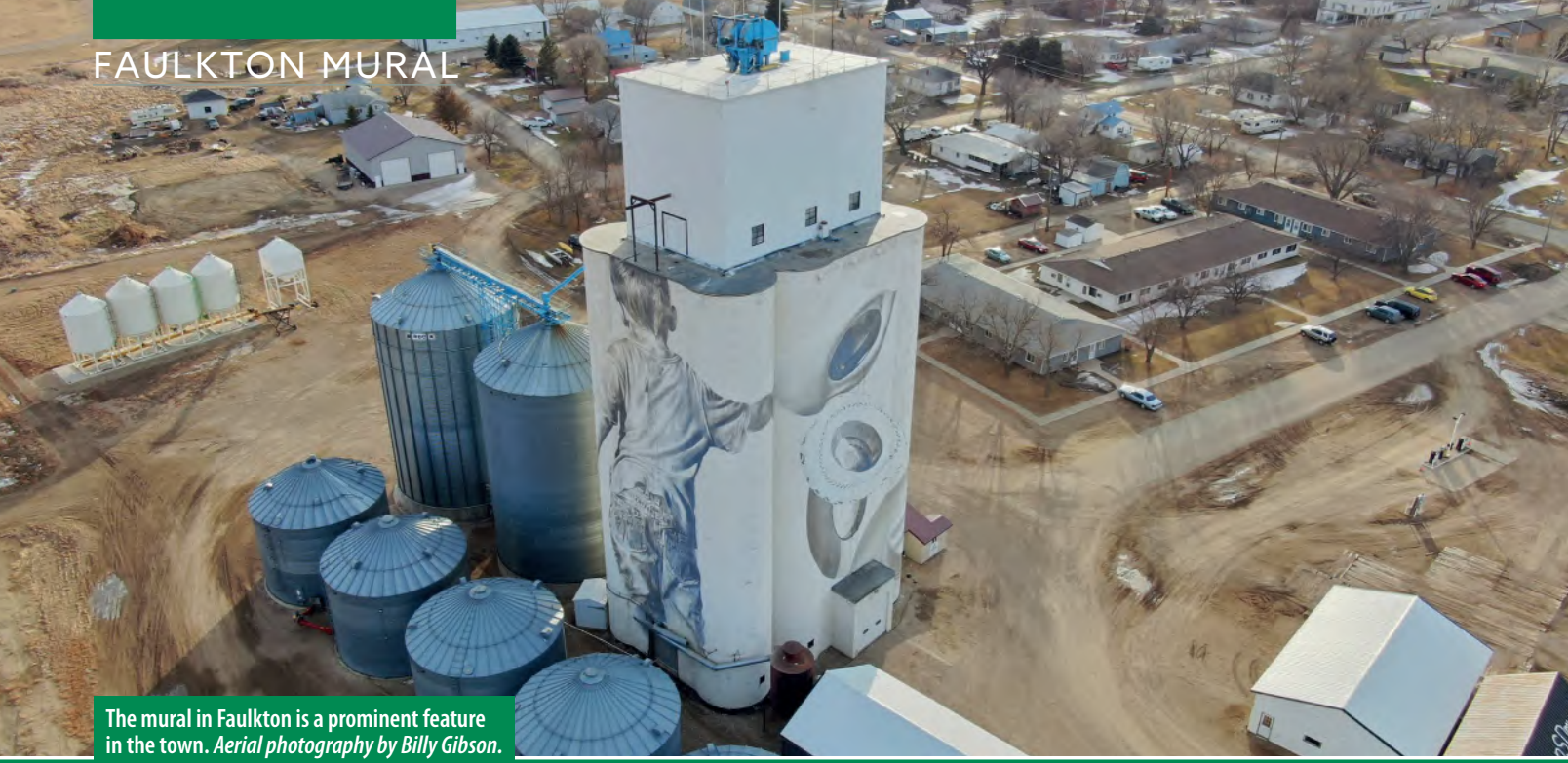
The mural in Faulkton is a prominent feature in the town.