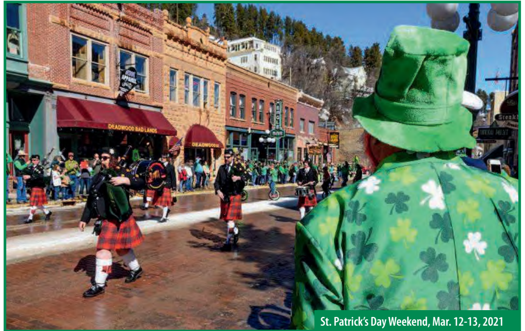
St. Patrick's Day Weekend, Mar. 12-13, 2021

St. Patrick's Day Weekend, Main Street, Deadwood, SD 605-578-1976