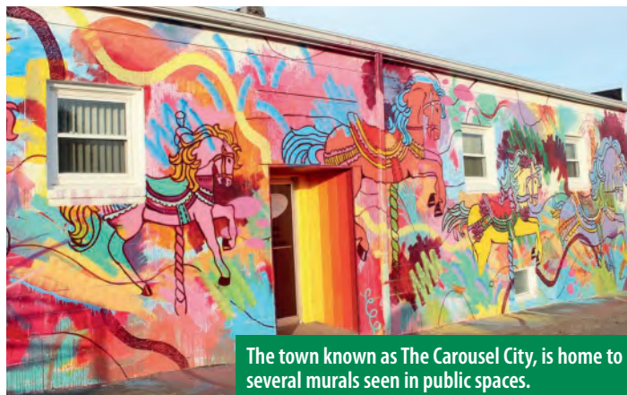
The town known as The Carousel City, is home to several murals seen in public spaces.

"That mural had such a positive impact on the community, I knew it would get the same kind of response here and create the