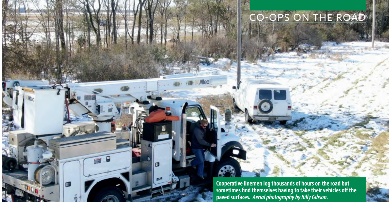
Cooperative linemen log thousands of hours on the road but sometimes find themselves having to take their vehicles off the paved surfaces.