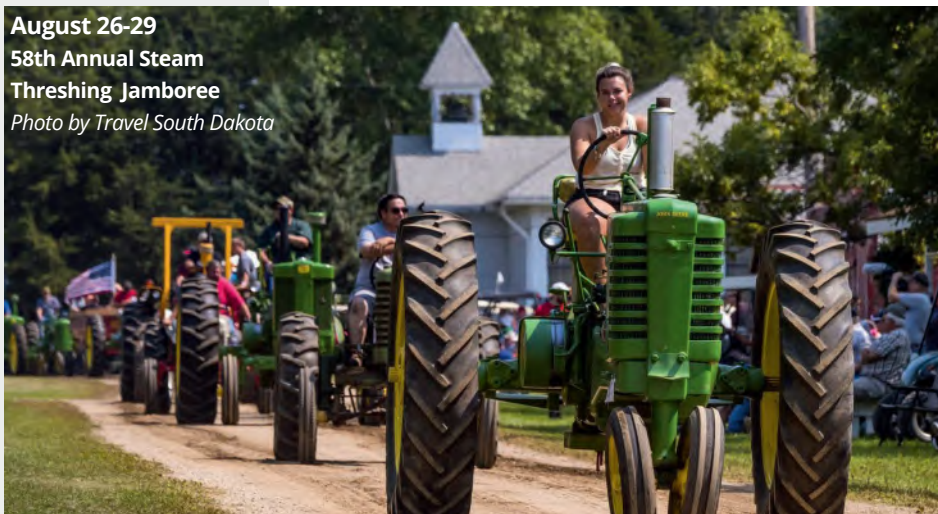
August 26-29 58th Annual Steam Threshing Jamboree

JULY 23-25 Arlington Days Various Locations, Arlington, SD, 605-983-5251