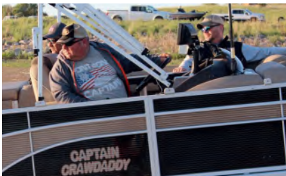
Crew members of the Captain Crawdaddy prepare to launch at Cow Creek.