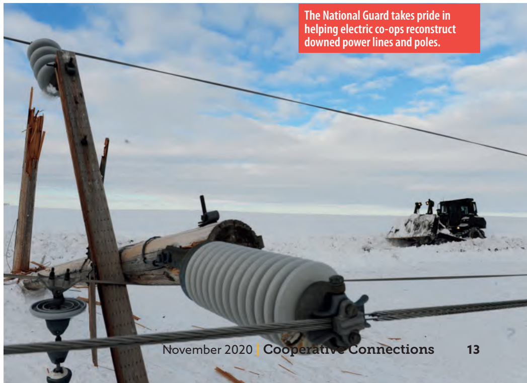
The National Guard takes pride in helping electric co-ops reconstruct downed power lines and poles.