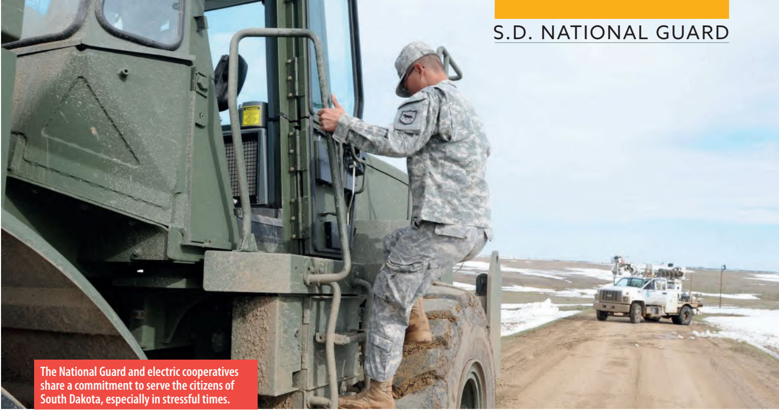
The National Guard and electric cooperatives share a commitment to serve the citizens of South Dakota, especially in stressful times.

violence and also deal with problems brought on by the COVID-19 pandemic.