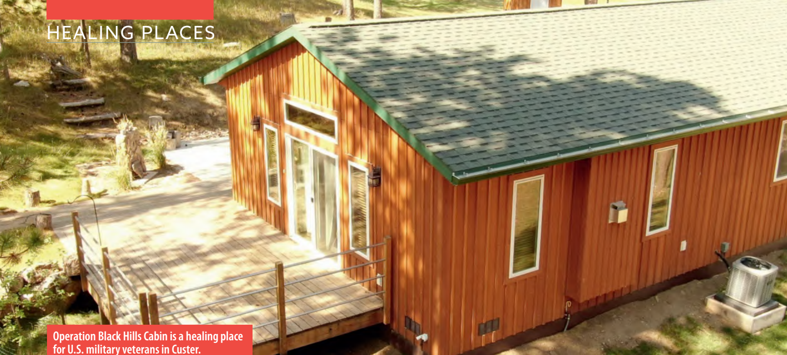
Operation Black Hills Cabin is a healing place for U.S. military veterans in Custer.