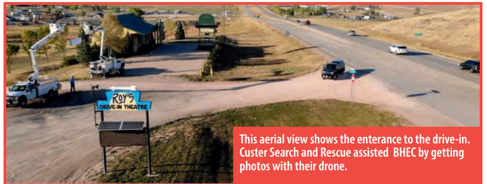
This aerial view shows the entrance to the drive-in. Custer Search and Rescue assisted BHEC by getting photos with their drone.