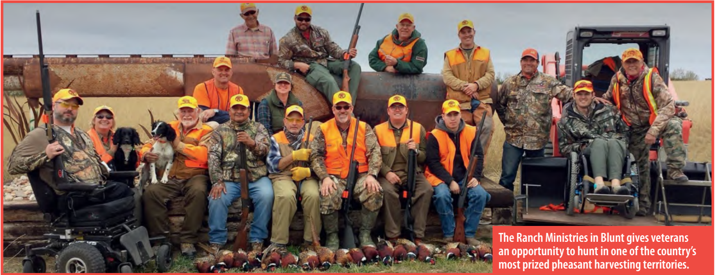
The Ranch Ministries in Blunt gives veterans an opportunity to hunt in one of the country's most prized pheasant harvesting territories.

and breadwinner is wounded and the wife has to take over," he said.