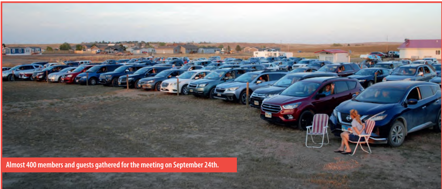
Almost 400 members and guests gathered for the meeting on September 24th.