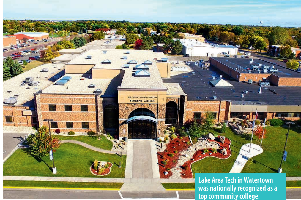
Lake Area Tech in Watertown was nationally recognized as a top community college.

The school boasts of its small class sizes, personalized attention and focused, hands-on learning. Its technical programs provide students with the practical skills to begin successful careers in a variety of industries immediately upon graduation. Liberal arts programs at Minnesota West are a great starting point for careers or further study in numerous fields. Credits earned in our associate of arts and associate of science programs are designed for seamless transfer to other Minnesota State institutions.