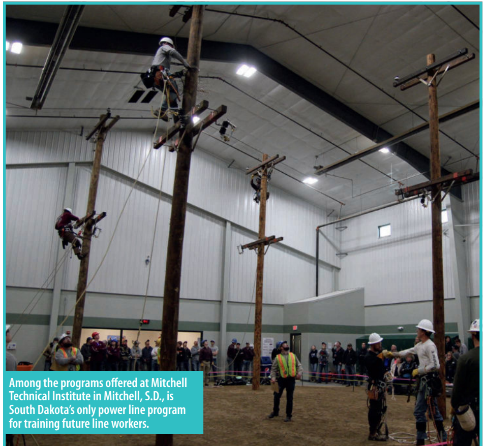
Among the programs offered at Mitchell Technical Institute in Mitchell, S.D., is South Dakota's only power line program for training future line workers.

Western Dakota Tech is the only technical college serving the western half of the state. It notes that 96 percent of its most recent graduates are working, continuing their education or enlisting in the military.